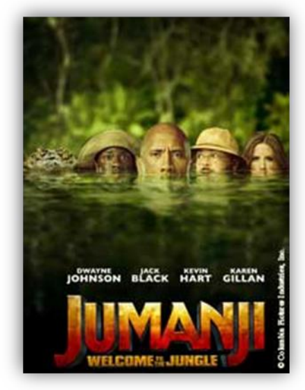
Movie in the Park

The Board does not meet during the summer months.